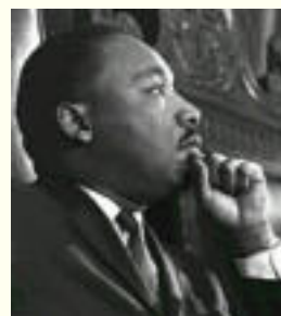
Martin Luther King